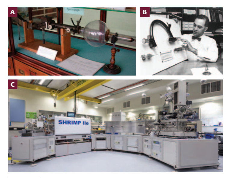
(A) Aston's third mass spectrograph, used for Pb FIGURE 2 isotope analysis; (B) Alfred Nier with the flight tube of his 180° mass spectrometer, used to measure the isotopic composition of uranium; (C) for comparison, a modern SHRIMP IIe SIMS instrument

In 1919, Francis Aston built an improved version of Thomson's "positive ray" instrument. Aston's "mass spectrograph" (FIG. 2A) used photographic plates to record the mass spectra of elements and allowed semiquantitative measurements of isotopic ratios. After confirming Thomson's work on neon, Aston went on to investigate the isotopic composition of many elements over his career, including "ordinary" lead from samples of lead ore in 1927 and "radiogenic" lead from uranium ore in 1929. Lead